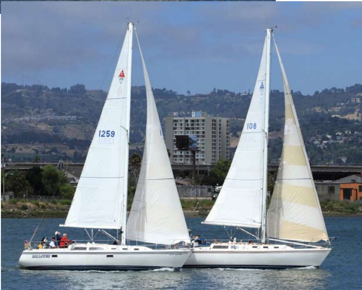
Top: Music and Casino cross the line Bottom: Sea Spirit leads Rollover to the line