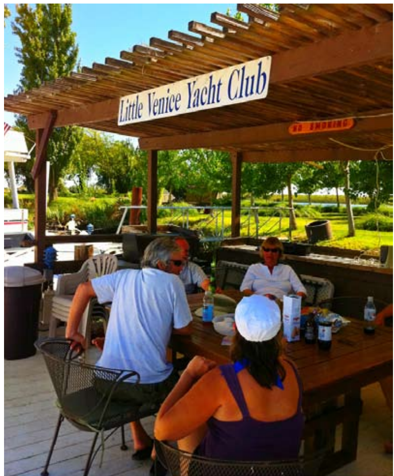
Relaxing at the Little Venice Yacht Club between Bocce ball games

Being Bar Pilots they also knew when a bulk carrier was going to pass so we could stand at the water's edge and shout until it sounded its horn back.