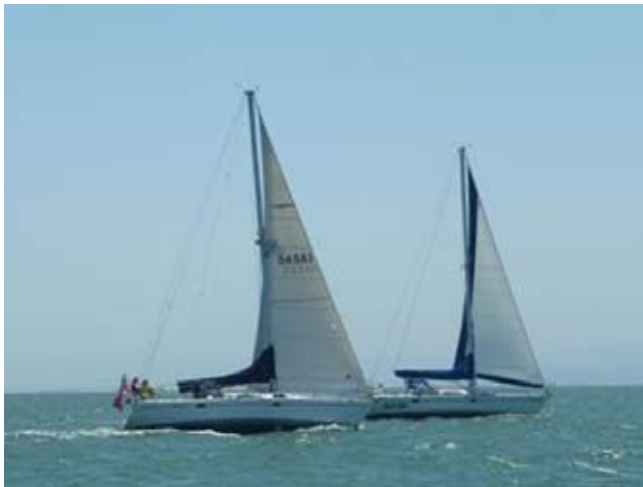
Music and Crew's Nest enjoy a lazy sail back up the South Bay