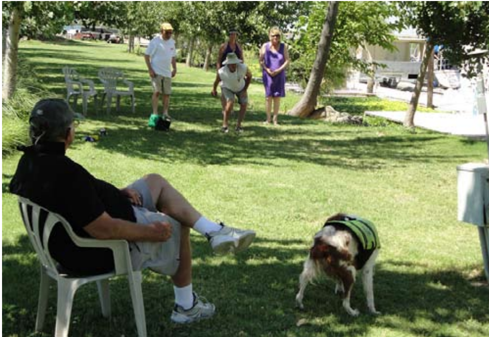
One of the tens of Bocce Ball games