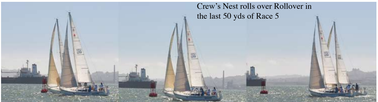
Crew's Nest rolls over Rollover in the last 50 yds of Race 5