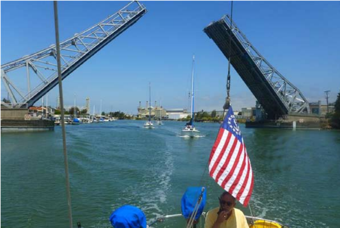
Stu Jackson ( Aquavite ) leads the group through one of the four opening bridges