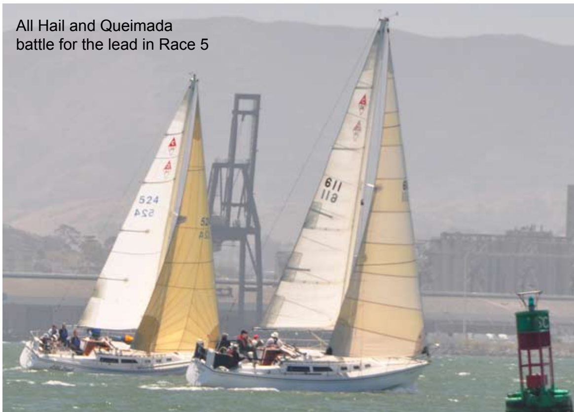
All Hail and Queimada battle for the lead in Race 5

Full details can be found at: http://www.jibeset.net/IC000.php?RG=T0080176