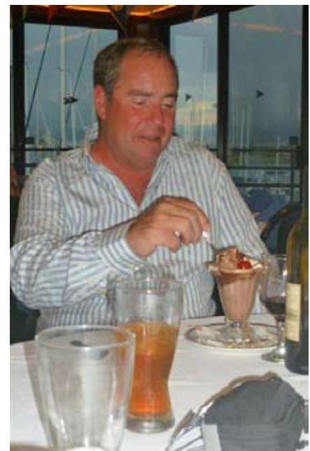
Dinner at Oakland Yacht Club Where do I start!