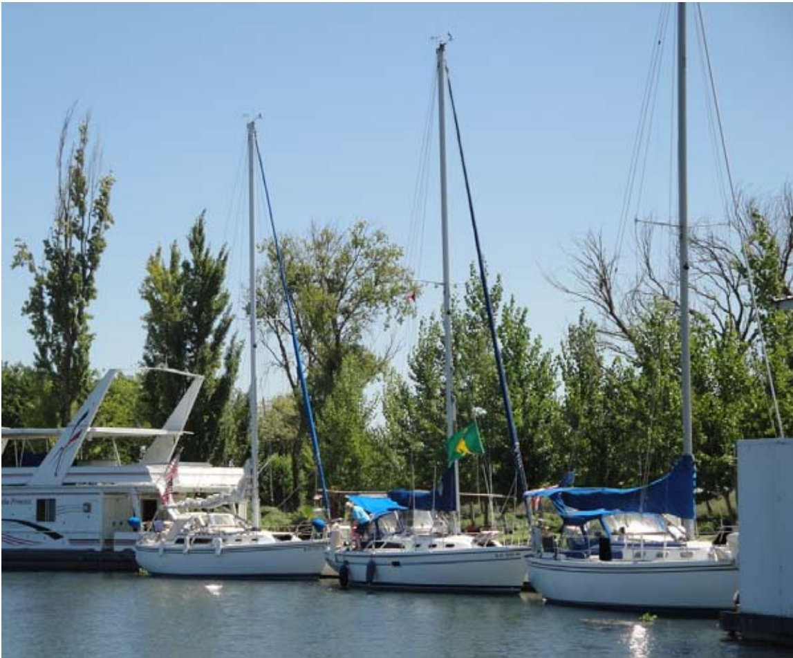
Little Venice Island Marina - Aquavite, Crew's Nest. Irish Whisky